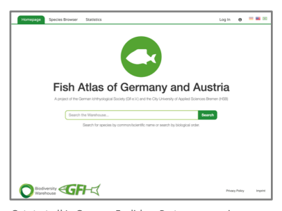
Get started! In German, English or Portuguese version www.fischfauna-online.de

So far, there is no official presentation of the distribution of all fish species all over Germany, where the responsibility for fisheries lies with the federal states. Thus, important basics for biogeographical and ecological questions as well as for protection and management concepts are missing.