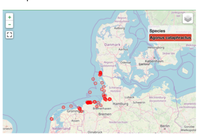
View at different zoom levels. Maps based on Open Street