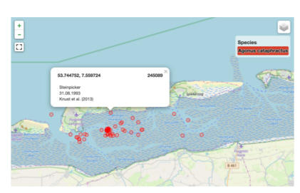
Distribution maps (pinpoint, exact specification of the data